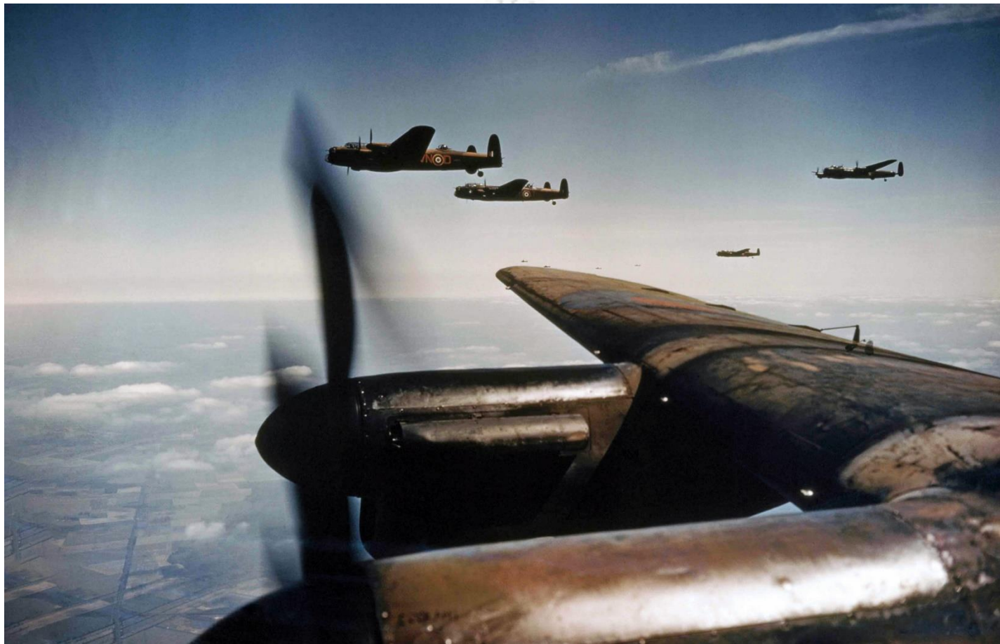
50 Squadron Lancasters